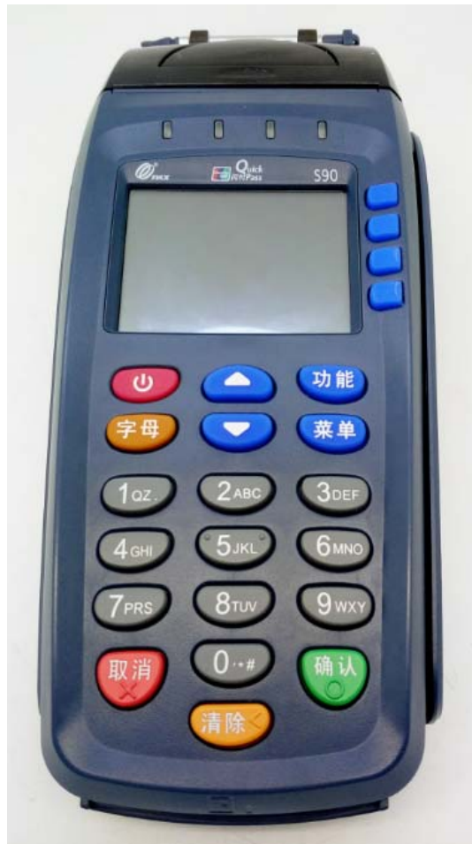
Figure 1 The front view of device

The front view of the device is shown as figure 1 below. The hardware version is printed on a label at the back of the device (See below figure 2). The labels at the back of the device shall not be taken off, altered or covered.