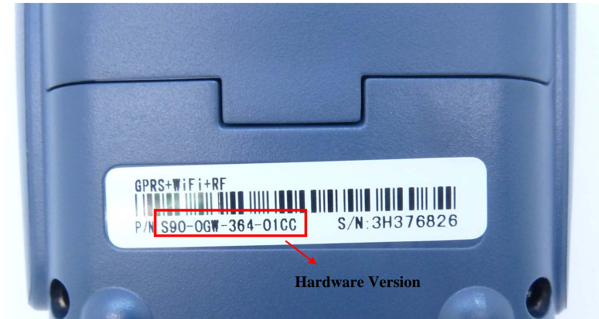
Figure 2 The back view of device