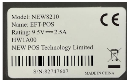
Figure 2: Label

The appearance of NEW8210 is the same as Figure 1, and the label is on the back of device.