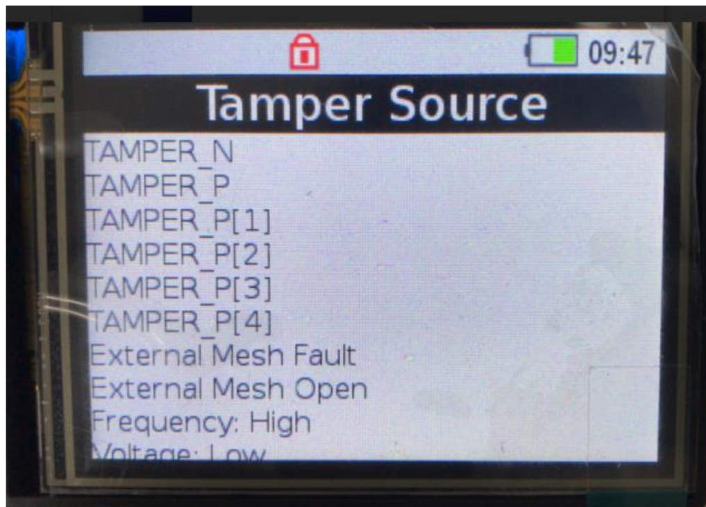
Figure 4: Tamper status