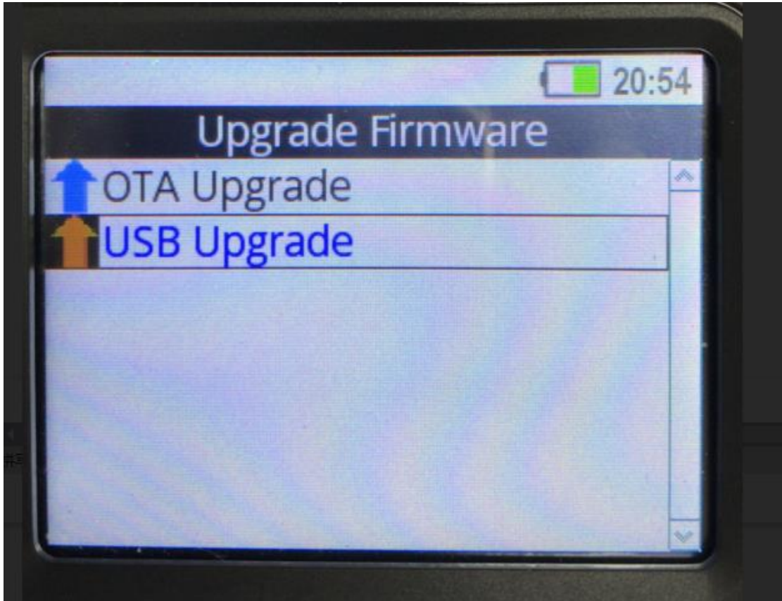
Figure 5: Update options