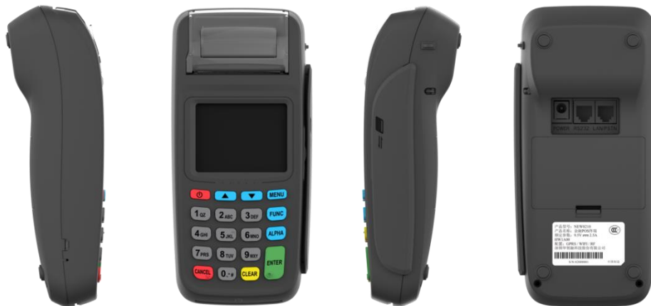
Figure 1: NEW8210 appearance