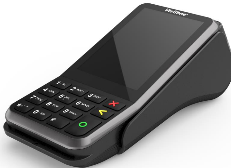
Figure 1, V400m Terminal