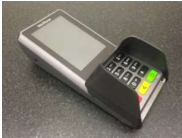
Figure 6, P400 Series Terminal with Privacy Shield