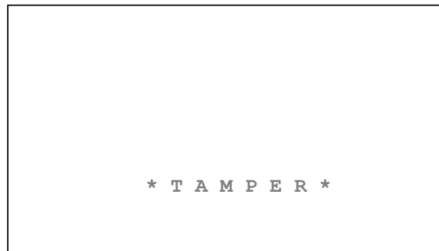
Figure 5, Tamper message on the terminal display