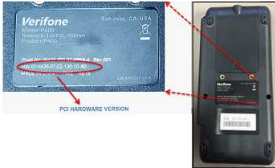
Figure 2, Hardware Identification