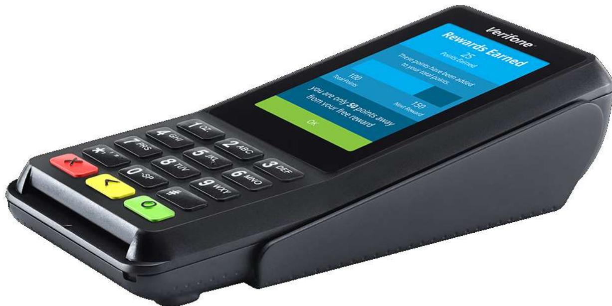
Figure 1, P400 Series Terminal